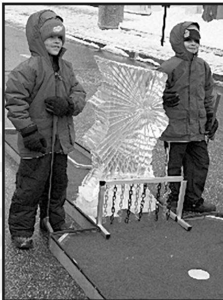
Left: Red wing fans guarding the put-put course ice sculpture.