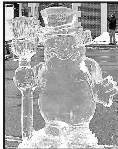
Below: Frosty the Snowman