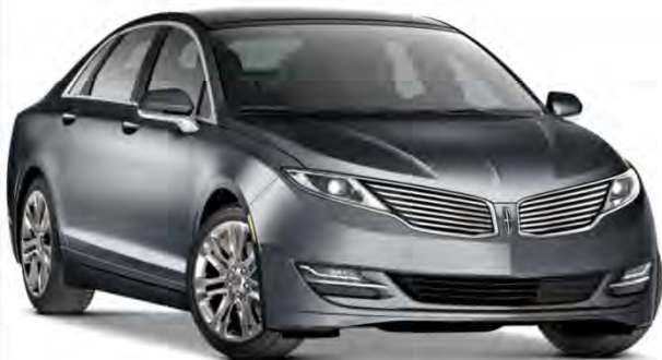
2013 LINCOLN MKZ