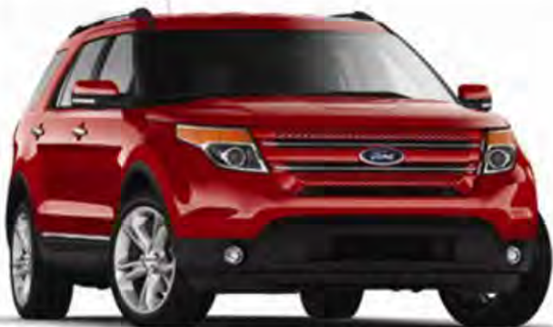
2013 FORD EXPLORER