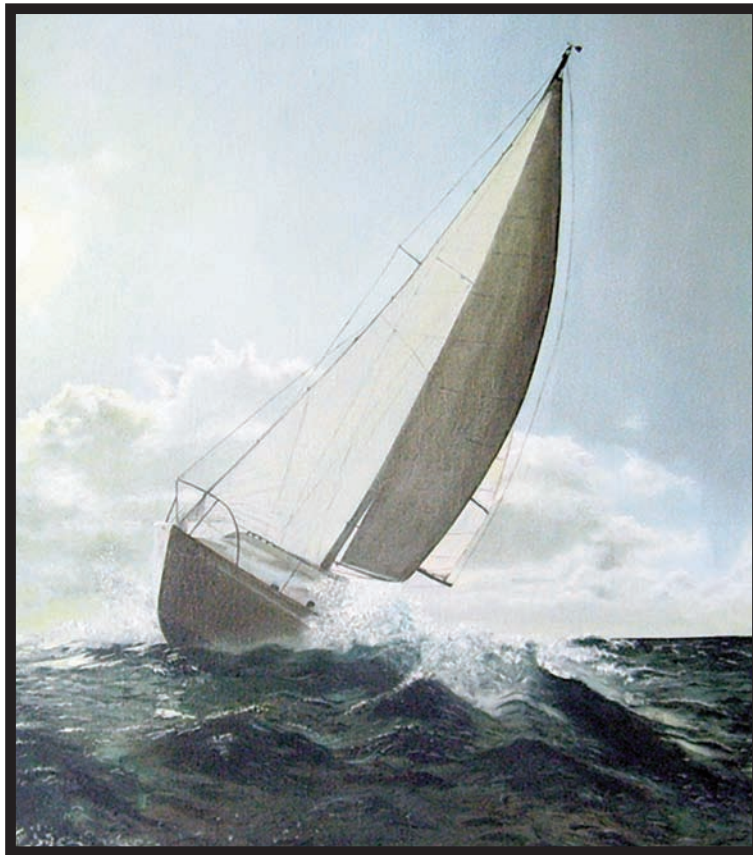
Donna Boydston Illustration