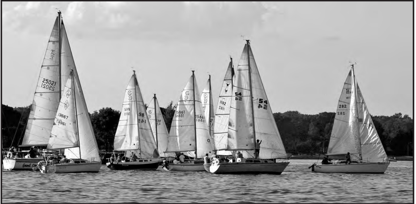
Racers prepare for a start in 2009