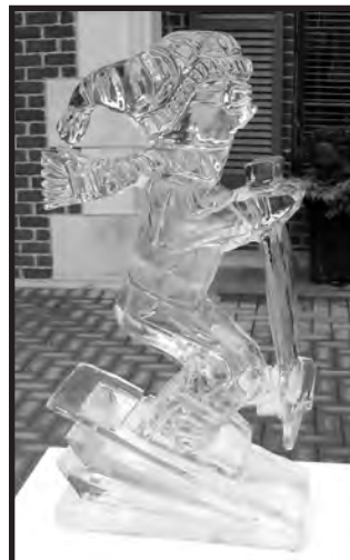
Lots of cool ice!

Thank you to the gracious volunteers that volunteered to support this event. Due to the demands of this event, we were not able to take a lot of photos. If you have photos from the event that