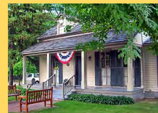
GP Historical Society Farm House